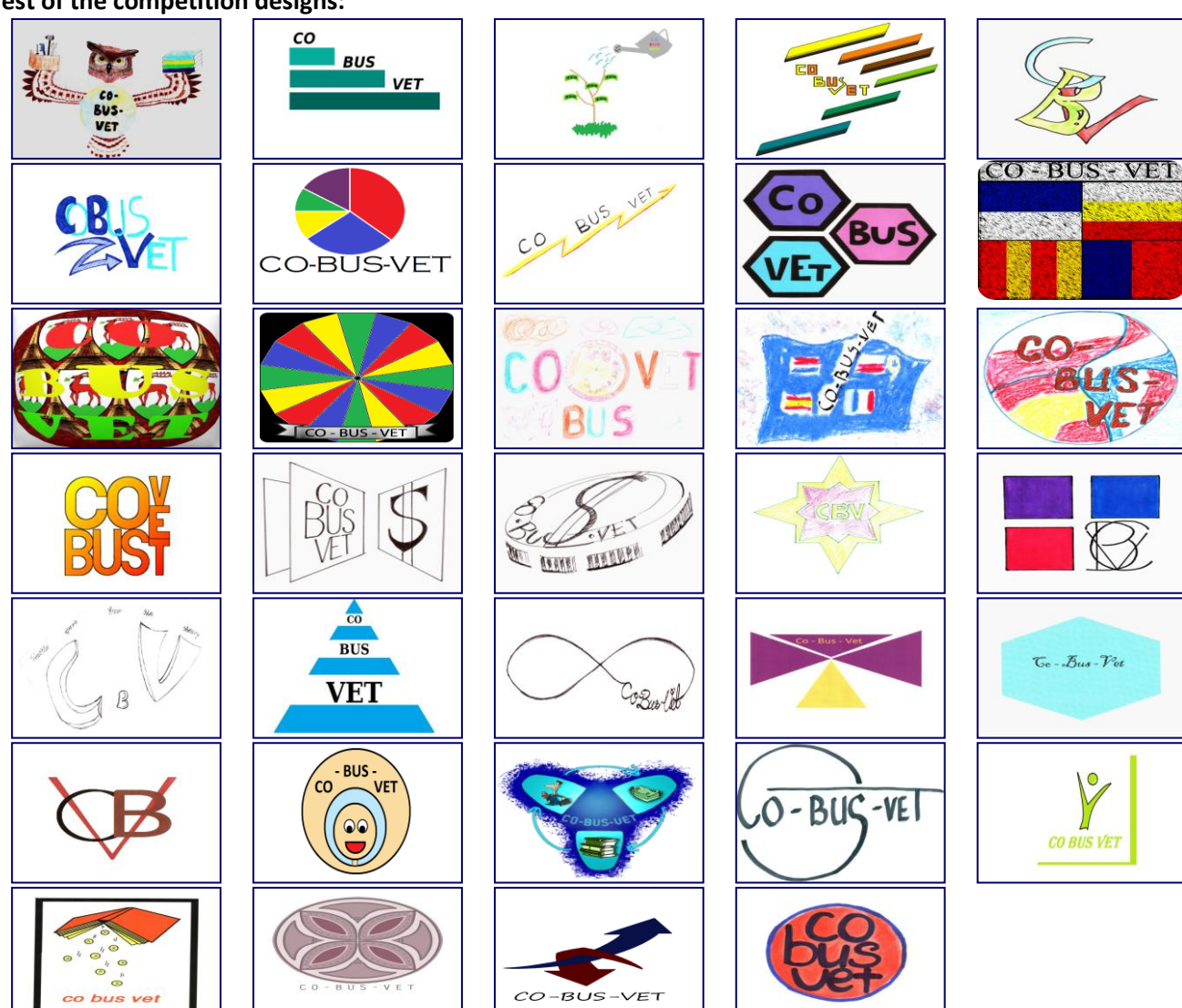
Jelenia Góra, 15 lutego 2014r.